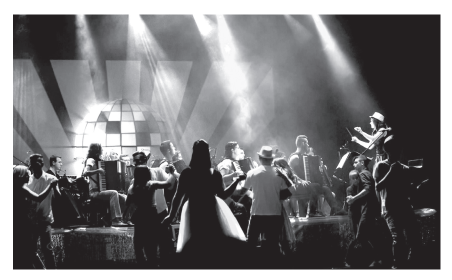
Figure 1. Poster for the musical and theatrical project Dirty Dancing, Slavonski Brod, 20 November 2015 (Agencija Komitet, Nuhanović, 2015a)

According to the plan, the project involved members of Brod Accordion Orchestra Bela pl. Panthy of Slavonski Brod, and members of the Institute of Music, Theatre and Multimedia of Sarajevo as the main actors, plus other music and dance artists without whom the implementation of the project would have been impossible. Special music guests included members of the band Trio + 2 from Slavonski Brod, and the dancers - members of the dancing club Aster from Sarajevo, and sport-dancing club Astra from Slavonski Brod.