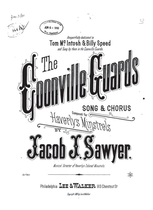
Figure 2: Title Page of Sawyer's The Coonville Guards (Sawyer, 1881).8

Numerous publications of Sawyer's music also contain dedications. Information on the individuals to whom his music had been dedicated is subject to further research.